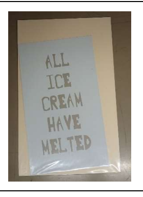
Card backing too large – print likely to be damaged by movement