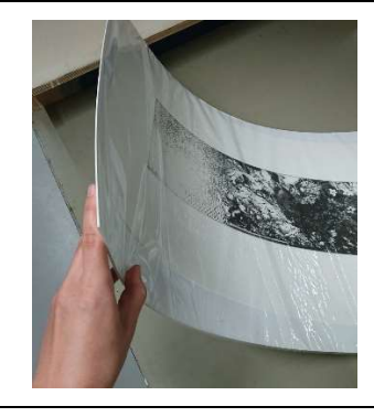
Card backing too thin – print likely to be damaged by bending