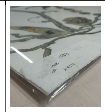
Cellophane dirty and covered in old stickers/tape