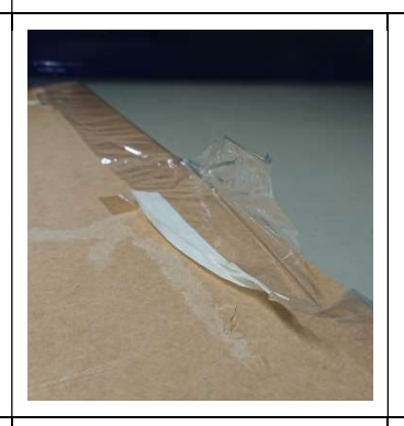
Cellophane ripped and badly secured on reverse