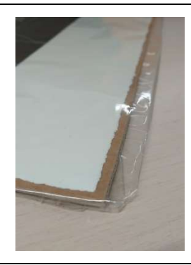
Cellophane too loose – print likely to be damaged by movement